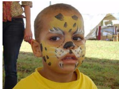
Rami the Cheetah in Nairobi

Maasai Wanderings offers unique African wildlife safaris, mountaineering treks, cultural experiences, historical site visits and beach holiday escapes exclusively in Tanzania.